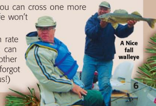
A Nice fall walleye