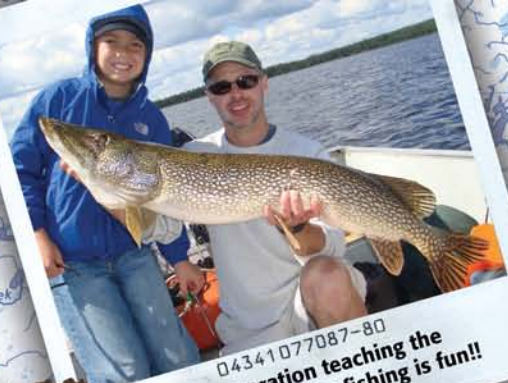
04341077087-80 2nd generation teaching the 3rd generation why fishing is fun!!