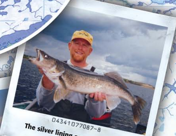
04341077087-8 The silver lining on a gloomy day!